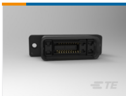
TE Part # 2-292181-0 PLUG ASS'Y OF HYB DRAWER 24P