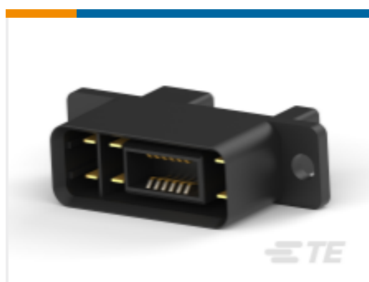
TE Part # 1-292183-2 PLUG ASS'Y OF HYB DRAWER 18P