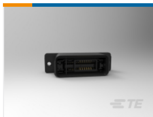
TE Part # 2-292181-8 PLUG ASS'Y OF HYB DRAWER 32P