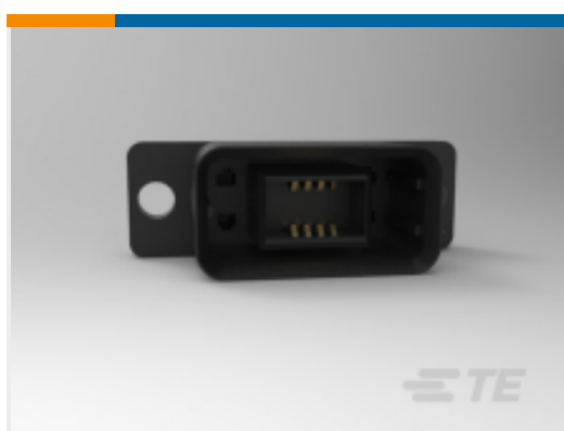
TE Part # 292182-8 PLUG ASS'Y OF HYB DRAWER 12P