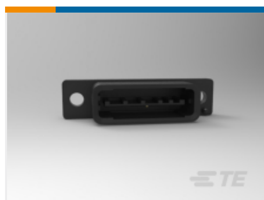
TE Part # CAT-AM7053-D797P Mini CT Drawer Connector Assemblies