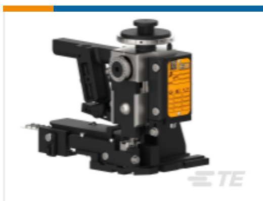
TE Part # 2151124-1 OCEAN-2.0-APPLICATOR-S-062F120F