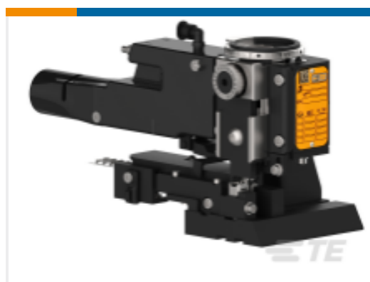
TE Part # 2-2151124-2 OCEAN-2.0-APPLICATOR-S-062F120F