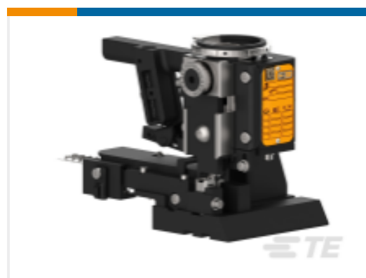
TE Part # 2-2151124-1 OCEAN-2.0-APPLICATOR-S-062F120F