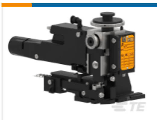
TE Part # 2151124-2 OCEAN-2.0-APPLICATOR-S-062F120F