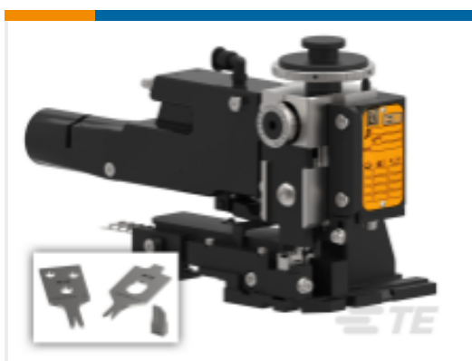
TE Part # 7-2151124-2 OCEAN-2.0-APPLICATOR-S-062F120F