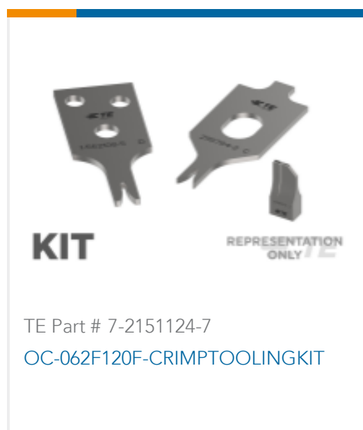
TE Part # 7-2151124-7 OC-062F120F-CRIMPTOOLINGKIT