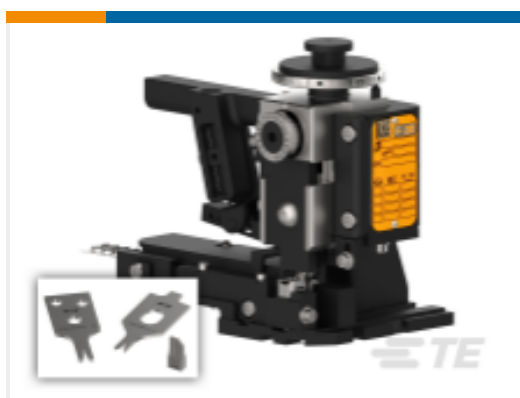
TE Part # 7-2151124-1 OCEAN-2.0-APPLICATOR-S-062F120F